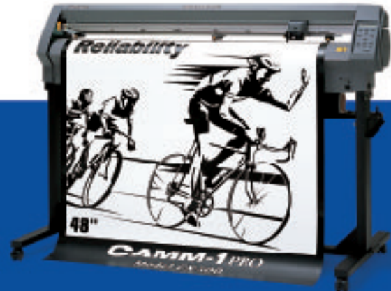
CAMM-1 PRO Model CX-500 Usable media width: 3-1/2 - 54" (90 - 1,372 mm) Maximum cutting width: 47" (1,195 mm)